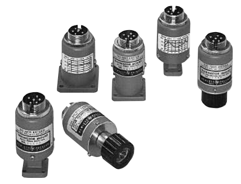
HP Thermistor Mounts